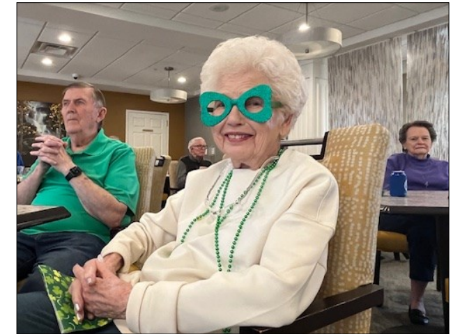
March Shenanigans ... Guess who?