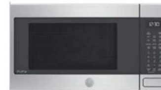
GE Profile PCWK15CIWSS Stainless Steel