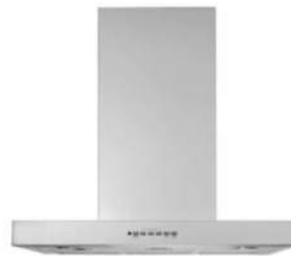
GE Profile UVW8301SLSS Stainless Steel