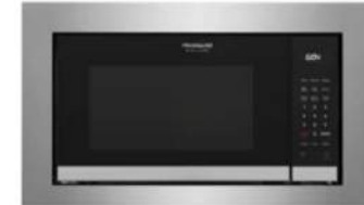
Frigidaire GALLERY GMBS3068AF Stainless Steel