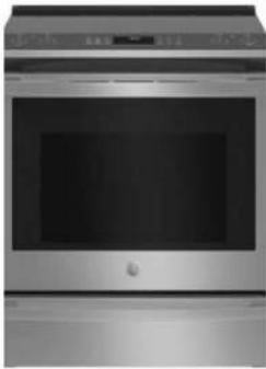
GE Profile PSS93YPFS Fingerprint Resistant Stainless Steel Gray Patterned Ceramic Glass Cook-Top Surface