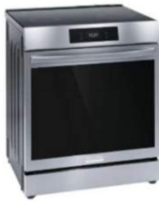
Frigidaire GCFi3060BF-A1 Stainless Steel